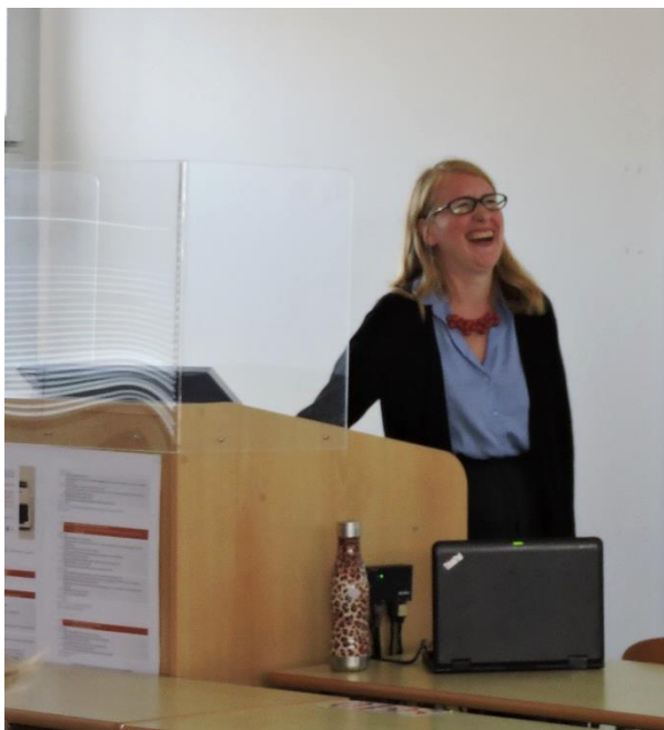
At the 10 th Doctoral Workshop (Pula, 2024)

curatorial teams who try to overcome such discursive codes and examine socialism in a more complex manner. But generally, I could say that the interpretations in museums are more conservative than those proposed by current historical science. It is certainly also a consequence of the fact that museums depend to a much greater extent on external actors.