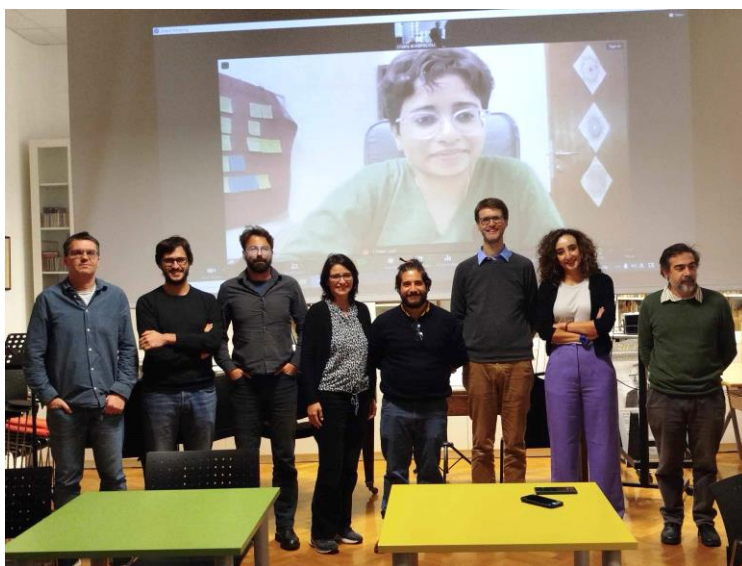
WO-NAM team with CKPIS members in Pula