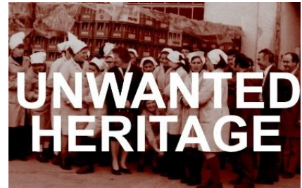
Essays of the project Unwanted Heritage