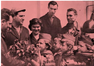
Books and papers of the project Making of the Socialist Man