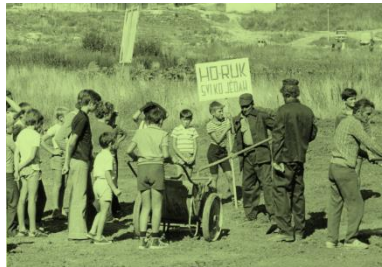
Books and papers of the project Microsocialism